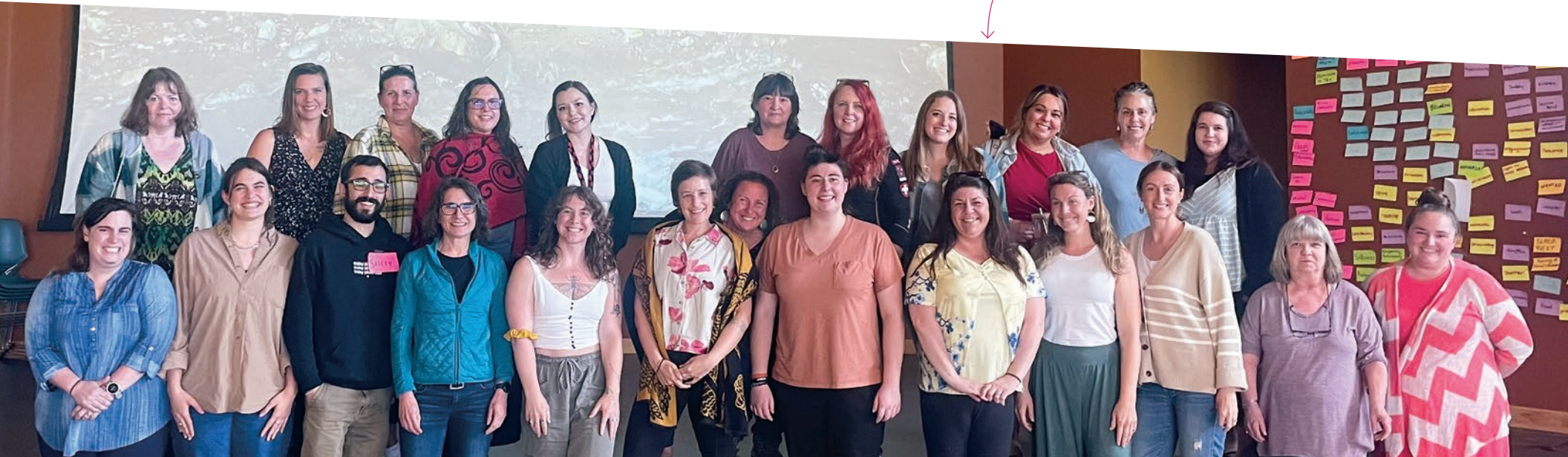
Umbrella Staff attend a 3-day Healing Focused Care training in June