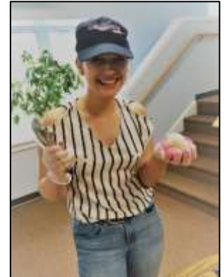
A student in the "Youth in Power Program" selling Umbrella's gelato with a mission.

Those who wish to take initiative can thrive and build something here that is fruitful and sustainable for a whole community. This is apparent now, more than ever.