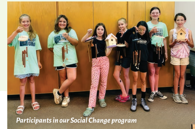
Participants in our Social Change program