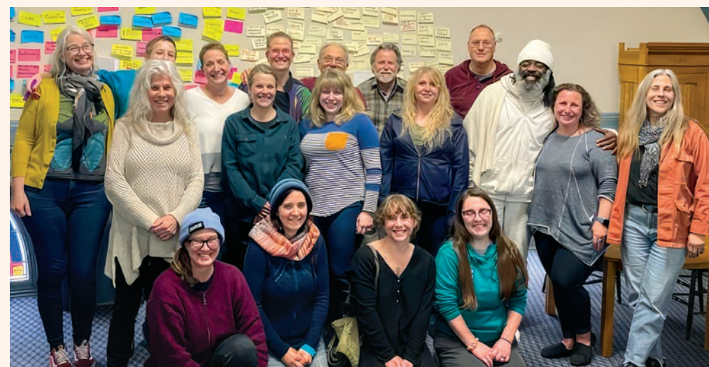
Umbrella staff and community members attended a 3-day Healing Focused Care training.

With the guidance, vision, and experience of NEK community members, organizational partners, and national leaders, Umbrella has officially launched The Spark Warmline and Ignite Change , domestic violence accountability classes. Both offer approaches to interrupting and preventing domestic violence that are novel in nature, implement evidence-based approaches, and operate in collaboration with two of the nation's leaders in domestic violence prevention work.