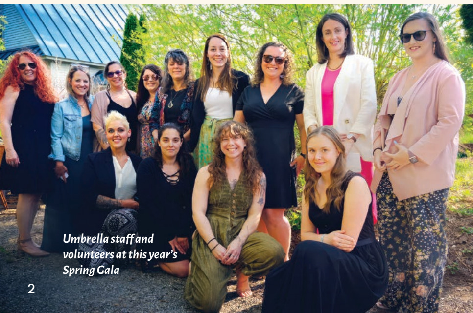
Umbrella staff and volunteers at this year's Spring Gala